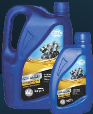
COOL MAKER (SYNTHETIC)