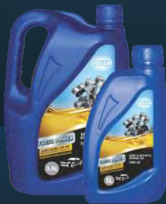
FRESH POWER (SEMI-SYNTHETIC)