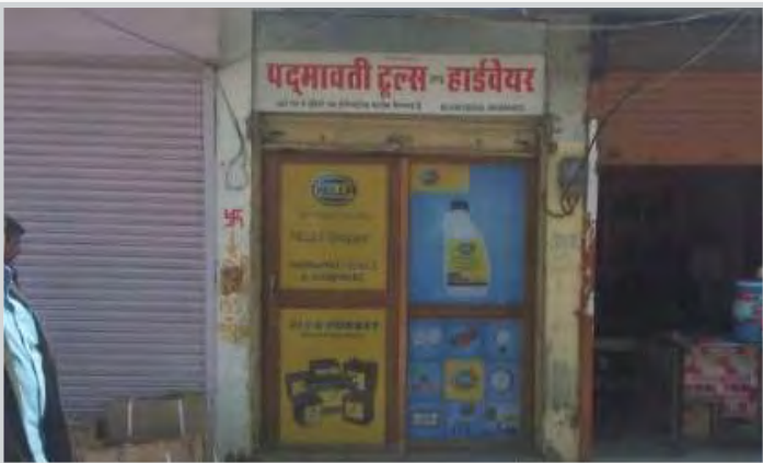
Padmawati Tools & Hardware (Rajasthan)