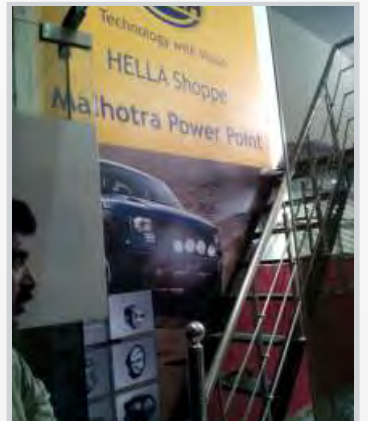
Malhotra Power Point,(Delhi)