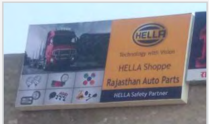
Rajasthan Auto Parts (Rajasthan)