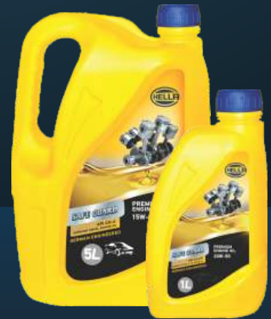
SAFE GUARD (PREMIUM)