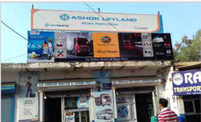
EK Omkar Motors & Spare Parts (Rajasthan)