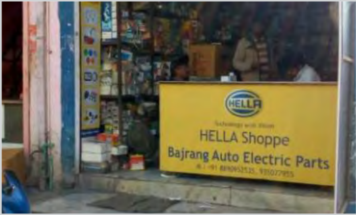
Bajrang Auto Electric Parts (Rajasthan)