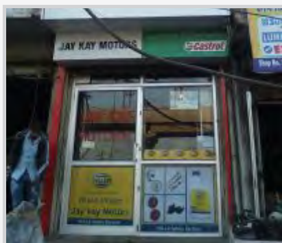
Jay Kay Motors, Faridabad