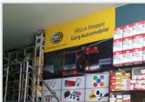
Garg Automobiles, Jind