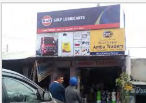
Amba Traders, Chandigarh