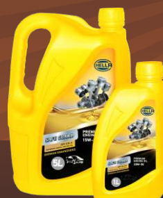
SAFE GUARD (PREMIUM)