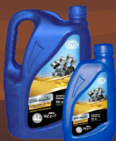
COOL MAKER (SYNTHETIC)