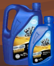
FRESH POWER (SEMI-SYNTHETIC)